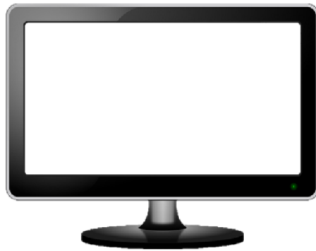
(TV outline for YouTube clip)